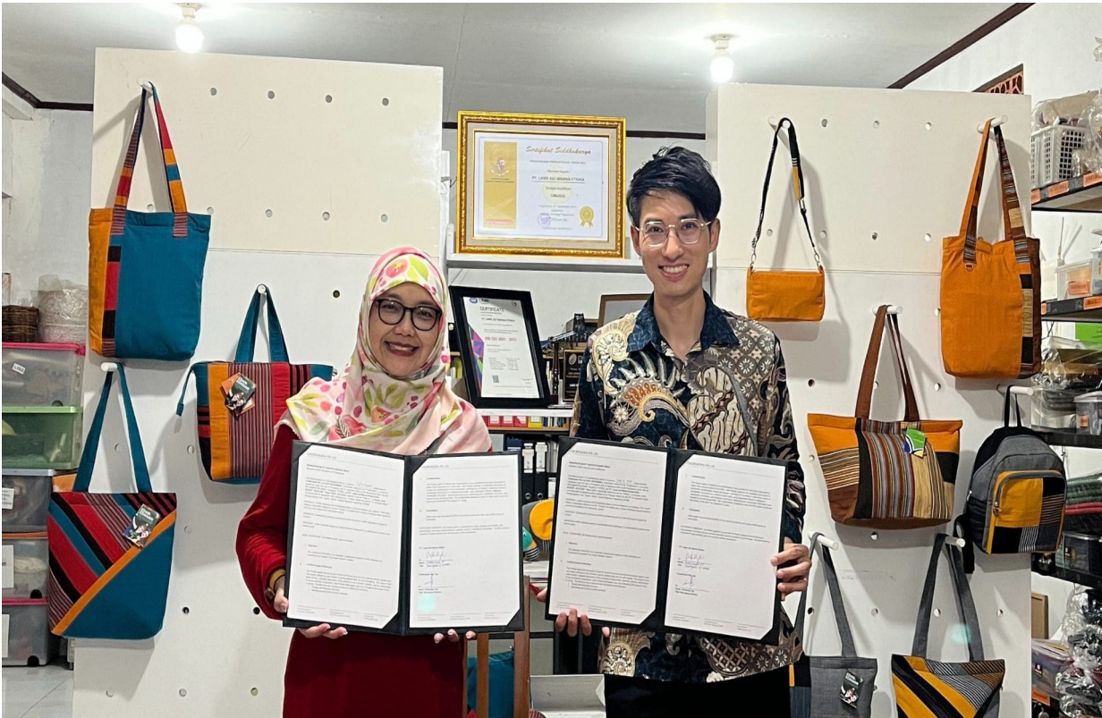
Creativeans Three Winning Projects at Global Design iT Award 2023.